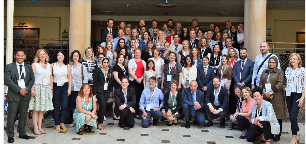
Dissemination and Communication