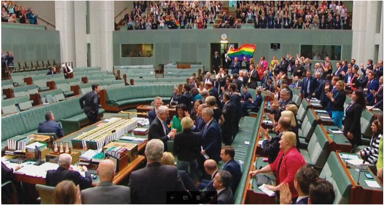
Still footage of a video taken by Missing Bits Productions