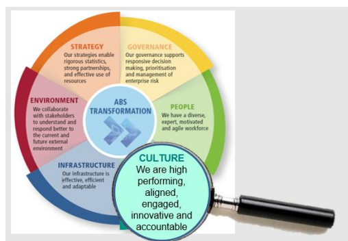
Figure 1: ABS Transformation Goals: