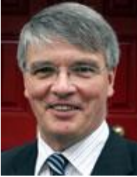
Paul Kenny, Pension Ombudsman Ireland

Example of 1 of 10 case studies used in Pension Ombudsman Annual Report.